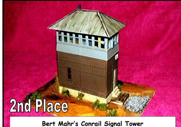
[Chopped Plasticville Signal Tower]

Bill Fraley's SW 1200 READING SW-14 [Converted SHS IC 1243]